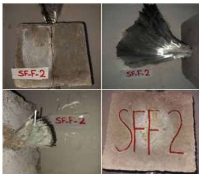
Figure 16 Specimen SF-F-2 after exposure.

Cracks appeared on the surface of concrete and along rebar at few locations. Resin of GFRP bar was burnt and the fibres were separated leaving brush like structure.