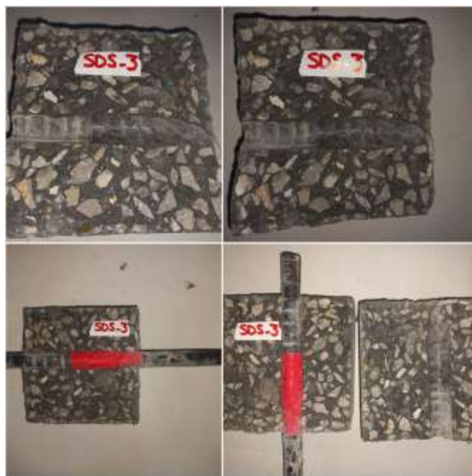
Figure 21 SD-S-3 tested specimen.

The SD-S-3 specimens after testing are shown in the figure 21 below. This specimen was broken from the center parallel to rebar. It was divided into two pieces and rebar remained attached with one piece