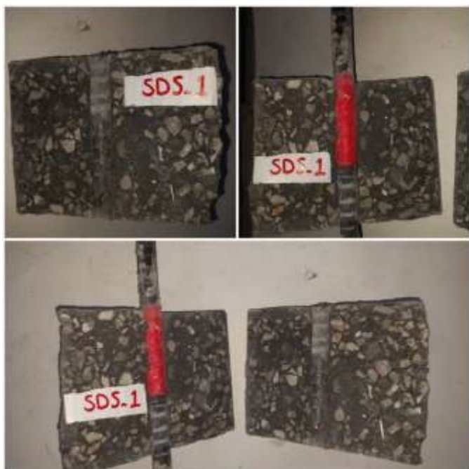
Figure 19 . SD-S-1 tested specimen.

SD-S-1 specimens after testing are shown in the figure below.