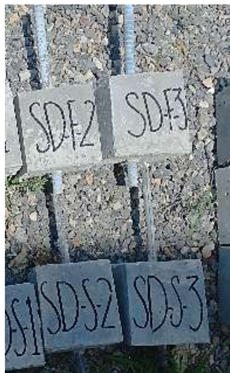
Figure 6 Specimens ready for testing

For the identification the specimens were named. The first alphabet in the nomenclature (S) denotes ‘Specimen’. The second alphabet (A, F, D, or C) denotes ‘Type of Test’; {“A” stands for Acid Exposure, “F” stands for Fire Exposure, “D” stands for Direct Pullout, or “C” stands for Compressive Strength}. The third alphabet (F or S) denotes ‘Type of Bar’; {“F” stands for FRP, or “S” stands for Steel}. Identification name was written on each specimen as shown in figure 6. Detail of specimens is shown in Table 2.