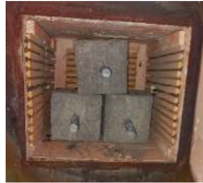
Figure 13 Specimens before temperature exposure

with a capacity to hold three specimens at a Time. The samples were exposed to high temperatures for About 2 hours and the readings were properly noted to obtain the time versus temperature curve. The Furnace took about one hour to reach the required temperature of 800 °C and then the same temperature is maintained for an hour.