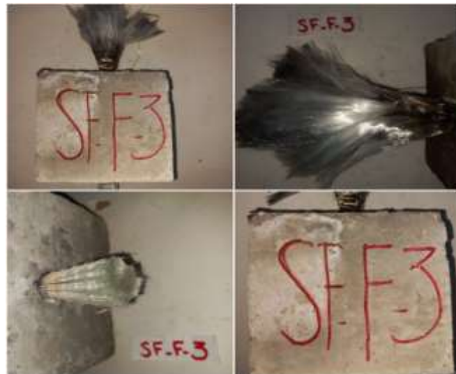
Figure 17 Specimen SF-F-3 after exposure.

Cracks appeared on the surface of concrete and along rebar at few locations. Resin of GFRP bar was burnt and the fibres were separated leaving brush like structure.