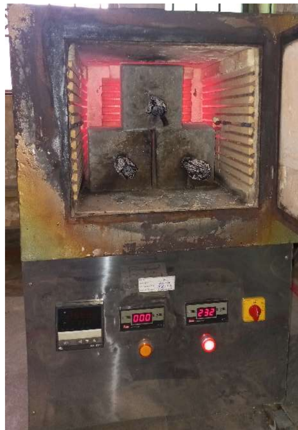
Figure 14 Specimens after temperature exposure