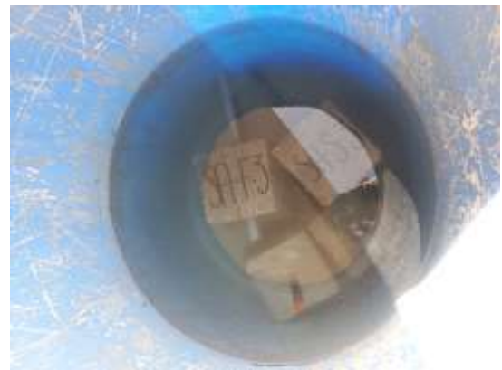
Figure 10. Plastic container for acid exposure of the specimens.

A circular plastic container shown in figure 10. was used for exposure of specimen to the acidic solution. Nitric acid (HNO 3 ) of 65% purity was used. The pH of the water was maintained at 2 and checked using electric pH meter.