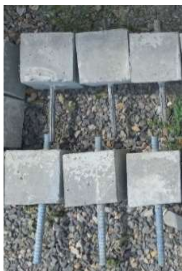
Figure 5. Specimens after removal of moulds