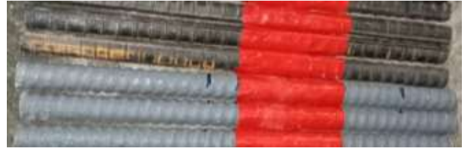
Figure 2 Development Length

A development length (within 6in cube) equivalent to three times the diameter of the bars that is equal to 2.25 in (56.25 mm) is provided in the concrete cube while the remaining 3.75 in (93.75 mm) of the bar was covered with duct tape. Both steel and GFRP bars are shown in Figure 2.