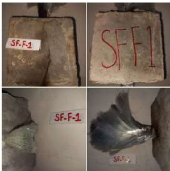
Figure 15 Specimen SF-F-1 after exposure.

Specimens with GFRP bars and subjected to elevated temperature are shown in figures 15, 16 and 17.