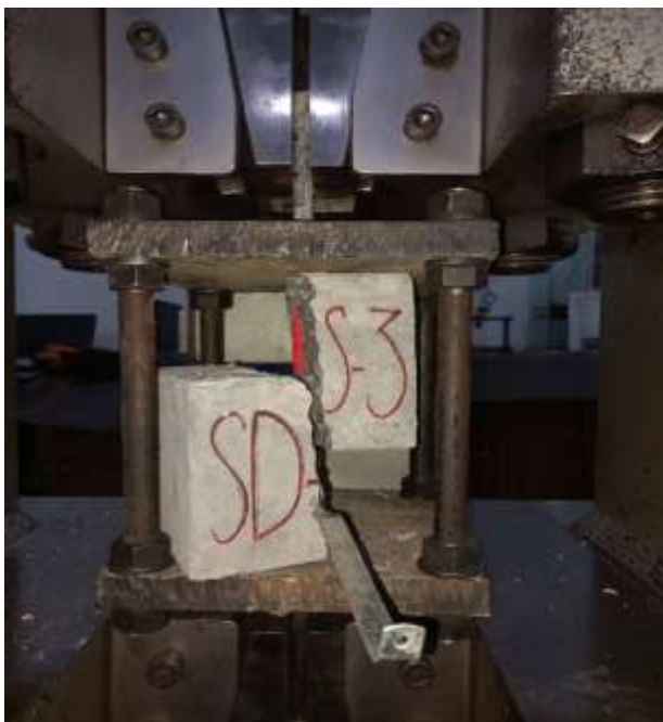
Figure 12 Specimen SDS3 after Pull-out Test