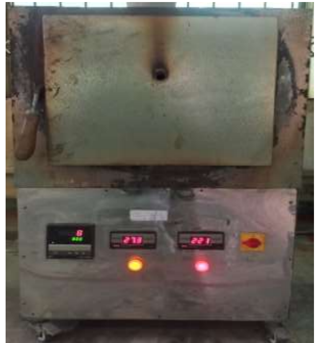
Figure 9 Electric Furnace

three specimens at a time. It took 1 hour to attain the desired temperature of 800 °C.