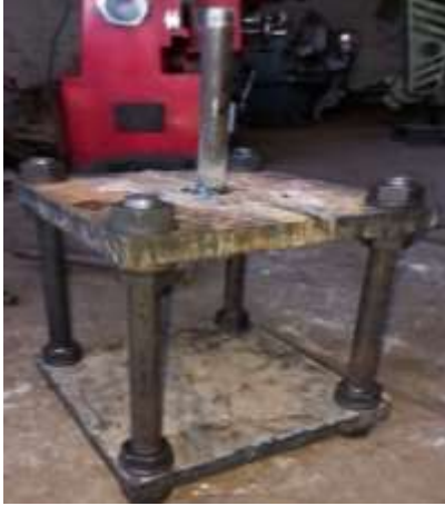
Figure 7 Assembly for pull-out test

sides to support plates. Fig 3.9 illustrates the dimensions of assembly for the pull-out test. Pull-out test was performed in the UTM machine as illustrated in Figure 8. Dial gauges were fixed at suitable locations to record the slip of the bars.