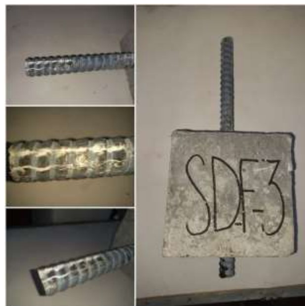
Figure 18 Specimen SD-F-3 after Pull out test.

Direct Pullout test was performed on SD-S-1, 2 and 3 and SD-F-1, 2, 3. As shown in figure 18 due to limitation of the equipment it was not possible to pull out GFRP bars to its full capacity. It was due to the reason that the bars were crushed in the jaws of UTM.