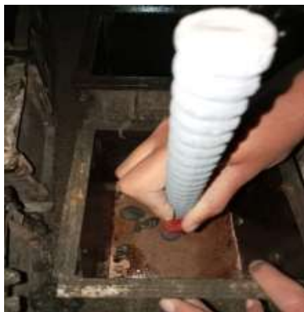
Figure 4. Rebar being placed in the mold.