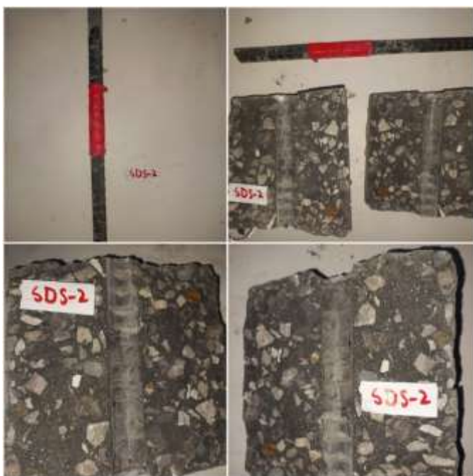
Figure 20 SD-S-2 tested specimen.

The SD-S-2 specimens after testing are shown in the figure 20 below.