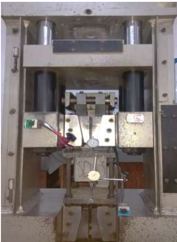
Figure 8 Pull Out test assembly fitted in UTM Machine.