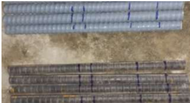
Figure 1 Ms and GFRP rebars used in the investigation.

15 in (375 mm) GFRP bars of 0.75 in (19 mm) diameter were used in the process. The spiral shape GFRP bars are typically used as an alternative to conventional steel bars in reinforced concrete structures. They come in the form of helical or spiral-shaped bars, providing axial reinforcement to concrete members like beams, columns, and piles. The helical shape offers increased surface area for bonding with the surrounding concrete, ensuring good load transfer and enhancing the structural performance of the concrete element. Both steel and GFRP bars are shown in Figure 1.