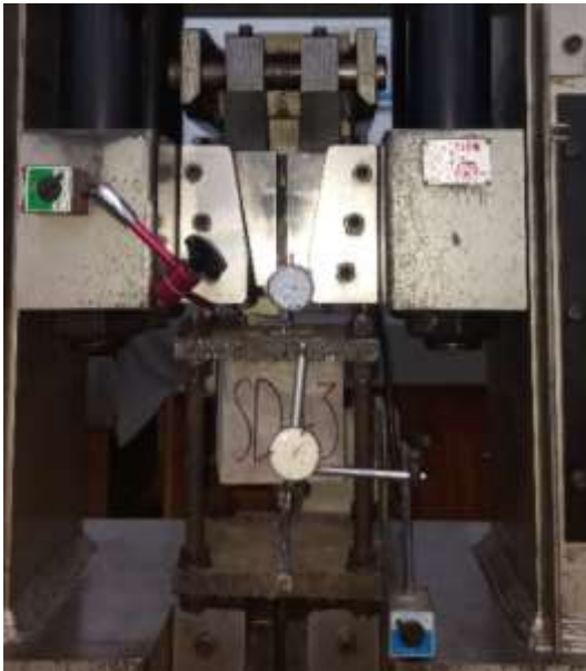
Figure 11 Specimen SDS3 Before Pull-out Test

concrete known as bond-slip are continuously measured and recorded by the UTM Machine and the deflection gauges. GFRP specimen SDS-1, 2 and 3 and SDF-1, 2 and 3 were tested after 28 days. These specimens were not subjected to any external exposure. Figure 11 and 12 illustrates specimens before testing and after testing respectively.